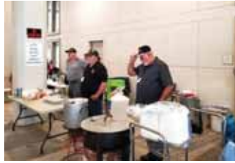
Volunteers hard at work serving the evening meal.