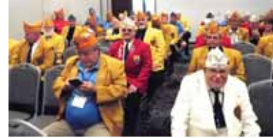
Nice crowd for the Memorial Service.