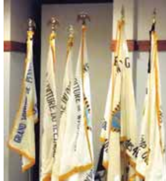
Great Lakes Grande Voiture Flags