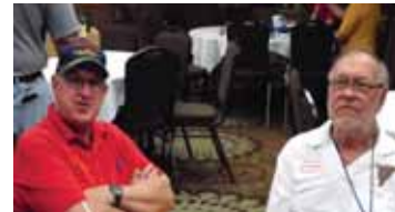
Charlie, just how did your new truck run out of oil?