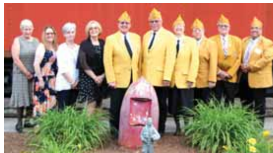
Combined National Forty et Eight Voyageurs and La Femme Officers.