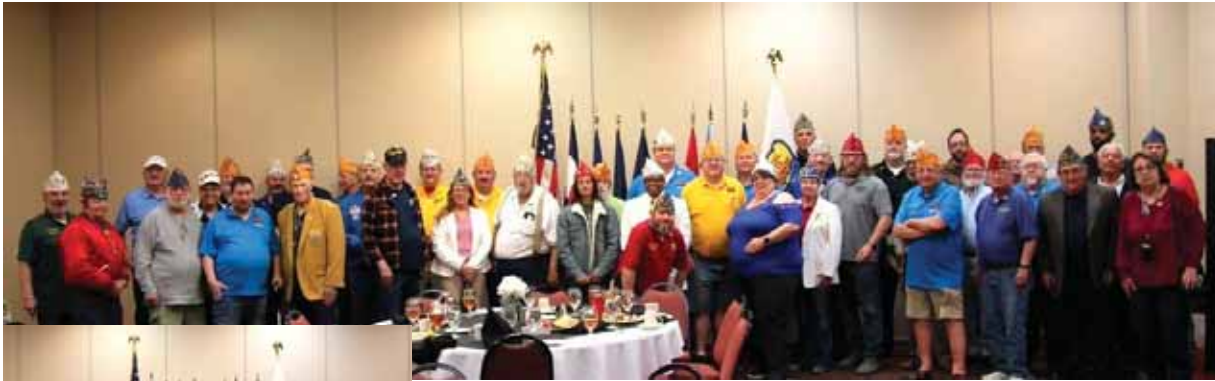
At the Saturday evening banquet