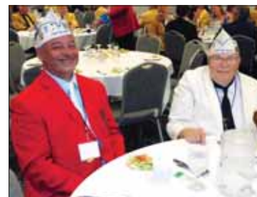
Grand Chefs at one of the special tables.