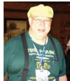
Chef de Chemin de Fer - 2006