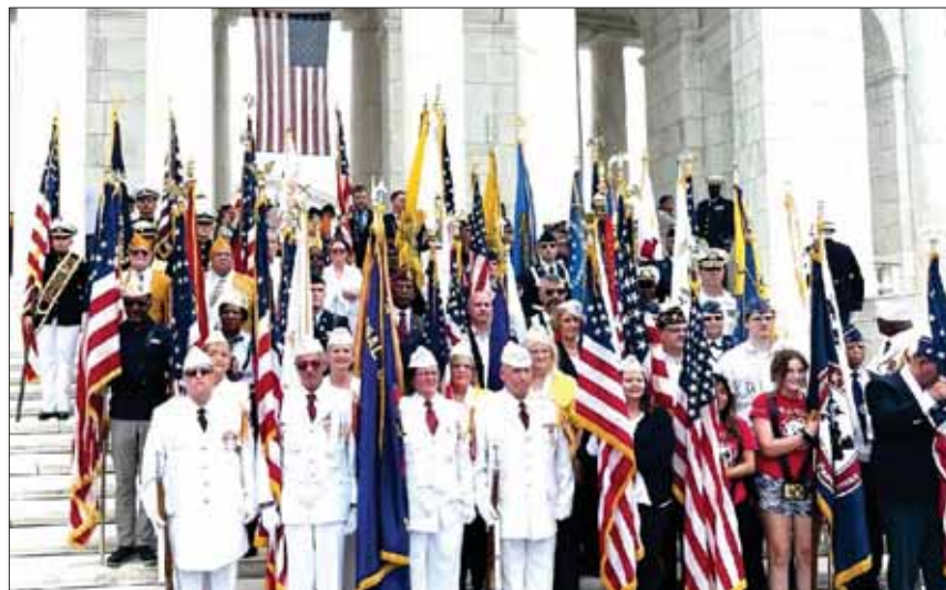
The massing of the colors in front of the National Memorial Amphitheater.