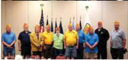
All the Gold Chapeaus