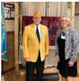
Having fun at the Gator Wreck