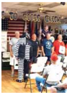
The evil jester meeting the PG's