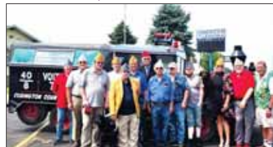
South Dakota Voyageurs next to one of their locomotives at their recently concluded Grande Promenade.