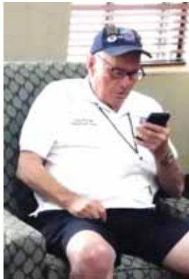
Oh Darn, the Cardinals got beat again!