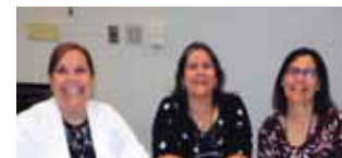
The ladies adding some class to the banquet.